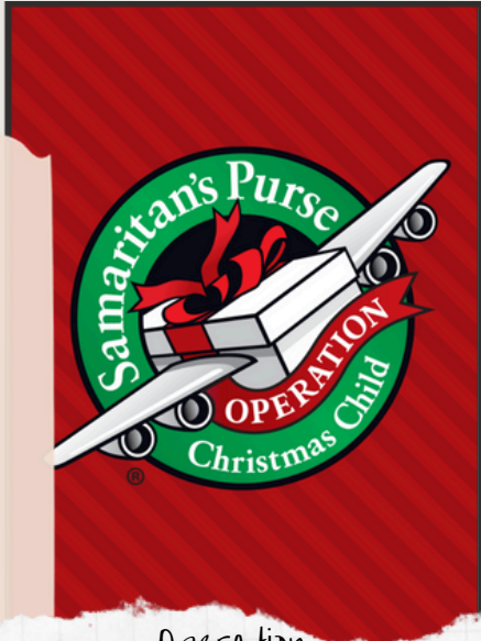
Operation Christmas Child

Get a sneak peak at what all has been going on in the newly aquired "Missions House."