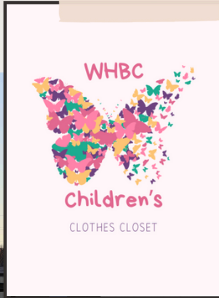
CHILDREN'S CLOTHES CLOSET