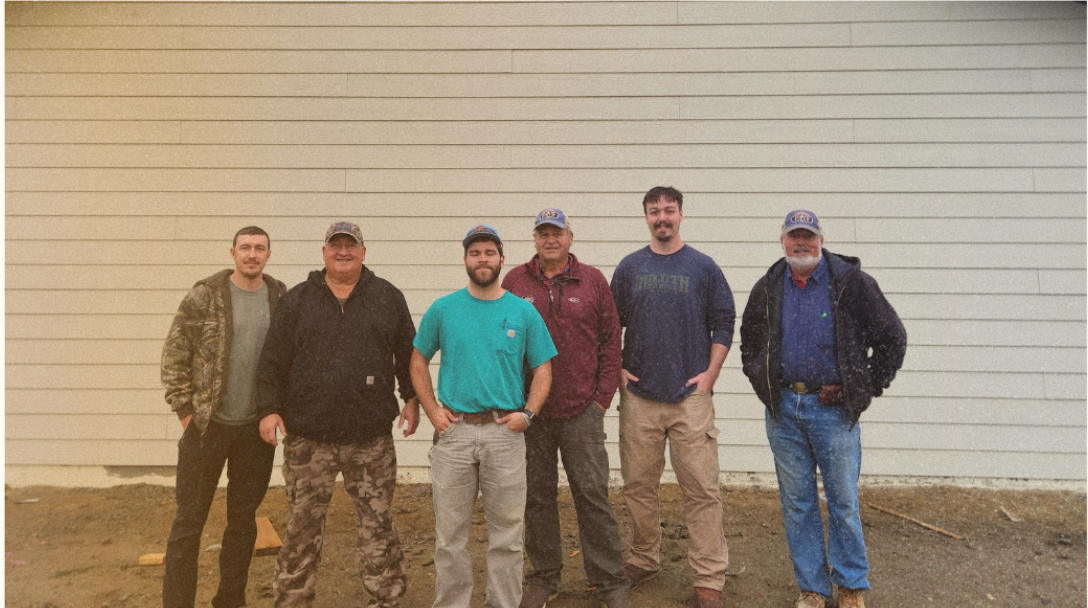
Members from Ecru Baptist and WHBC worked together to finish the outside of the church building at Dakota Baptist Church.