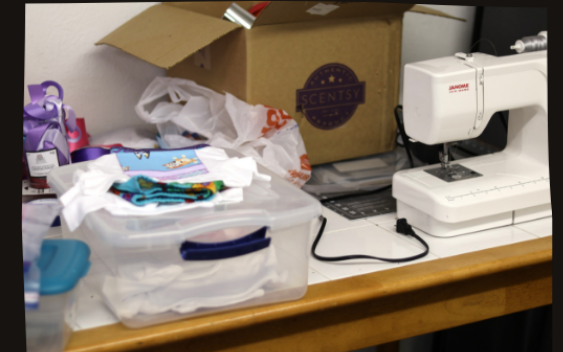
Planting, sewing, and horses for outreach into the community.