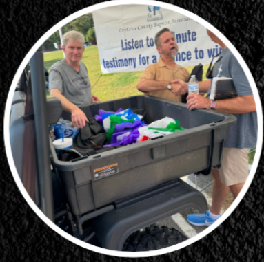
Pontotoc Baptist Association hosted a tent at Bodock Festival to share the gospel. The gospel was shared around 200 times..