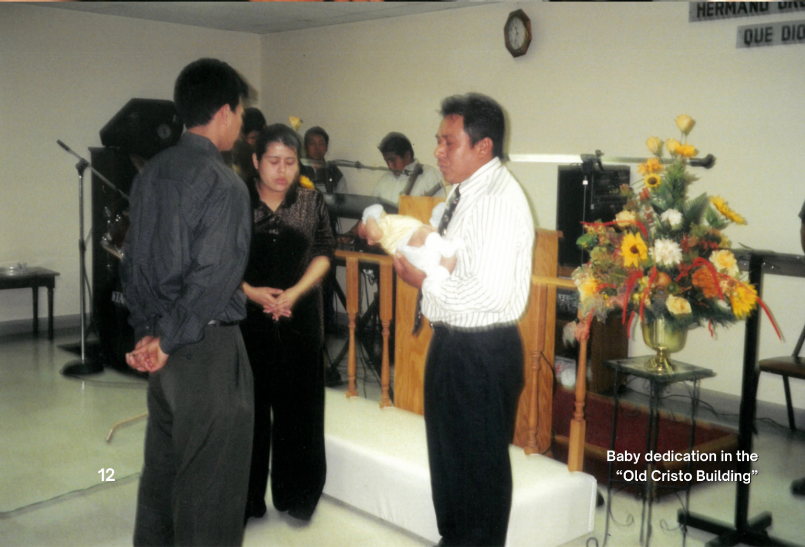
Baby dedication in the "Old Cristo Building"

We often combine our efforts in outreach, hold worship services together, and take up offerings to support them. In fact, Cristo Vive seems to be growing exponentially! Just last year, they were able to get their own building and move out of what is now our "Missions House." However, this does not mean that they no longer need our support.