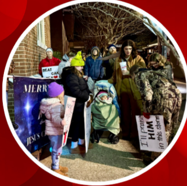
West Heights Missions entered a group into the Pontotoc Christmas Parade to share "cardboard" testimonies in order to share how Jesus Changes Things.