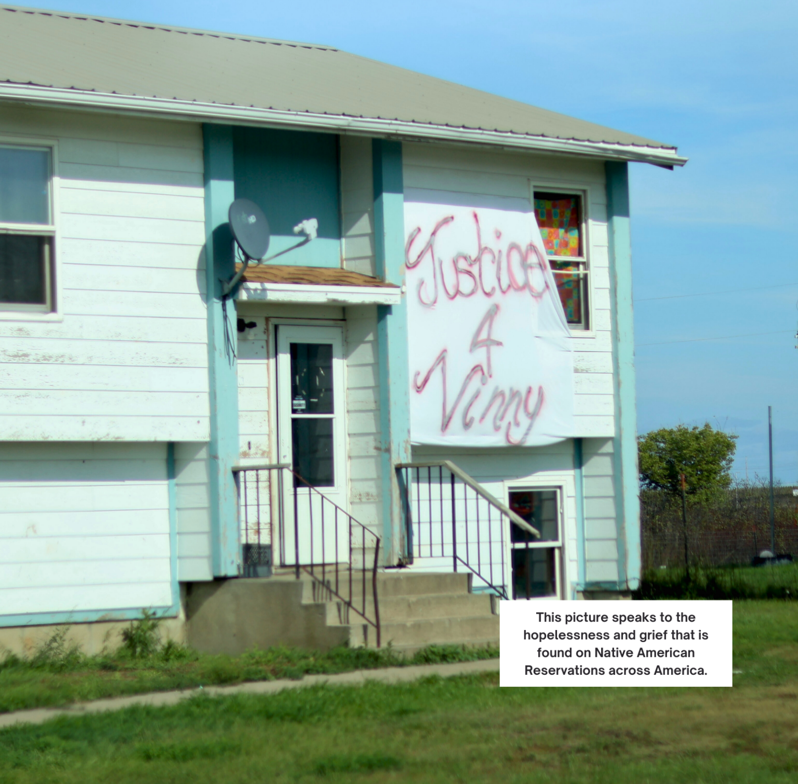
This picture speaks to the hopelessness and grief that is found on Native American Reservations across America.